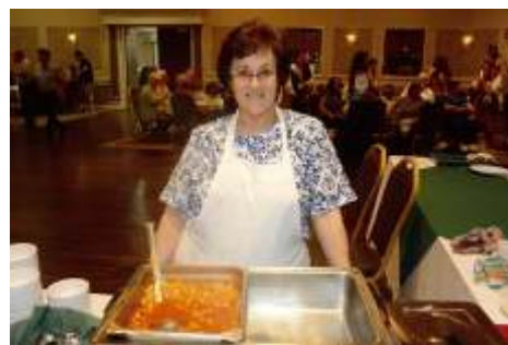
Club Italia- Festa Italia

“We have missed you all and cannot wait to celebrate our culture and traditions with you.”